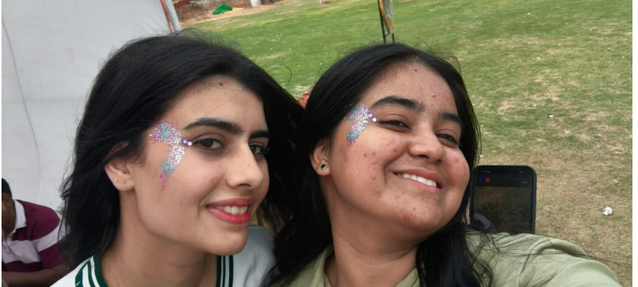
CANVAS PAINTING: -