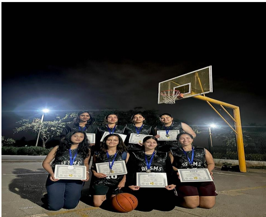
GIRLS' BASKETBALL TEAM