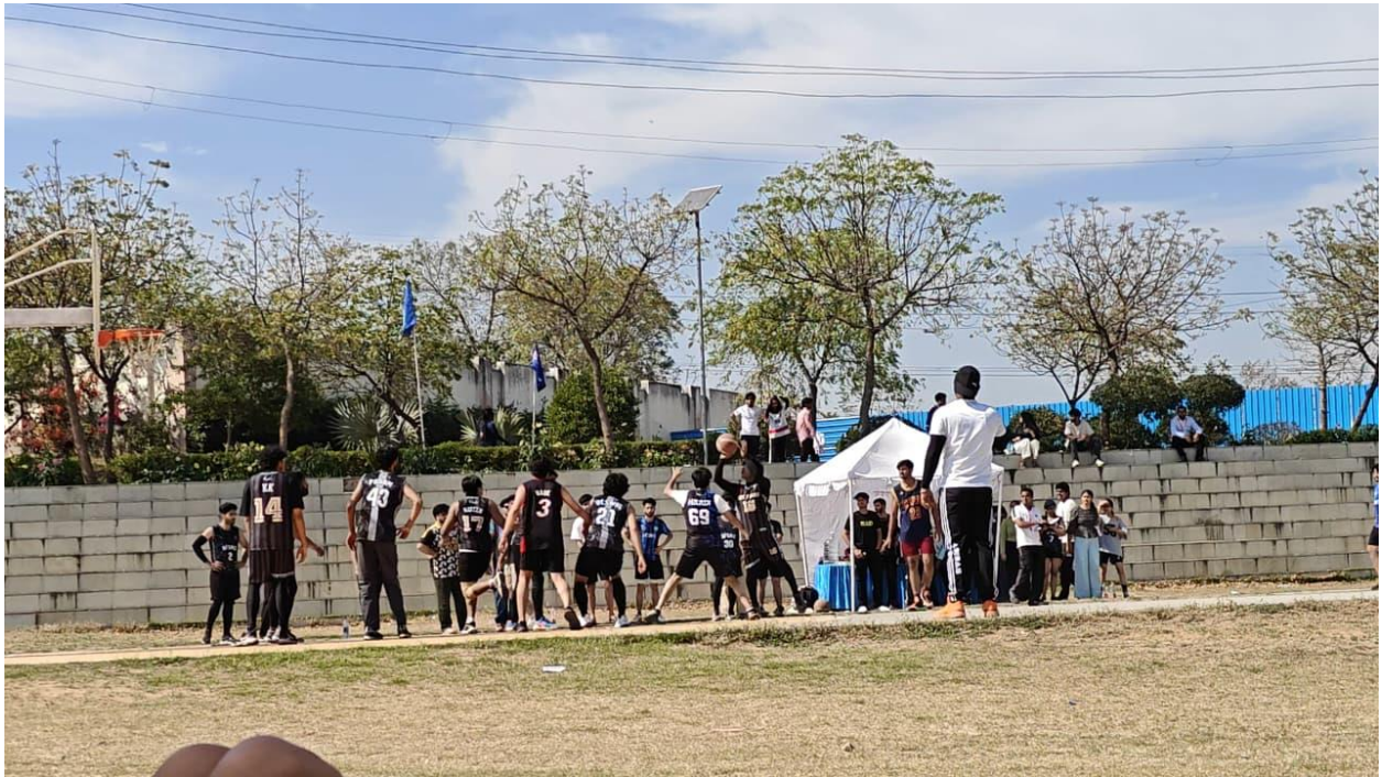
BOYS' BASKETBALL TEAM